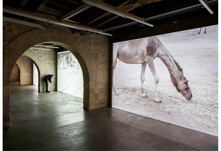
Arc en Rêve - Bordeaux, France