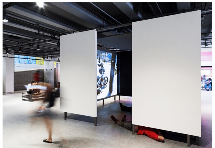
São Paulo Architecture Biennial - São Paulo, Brazil