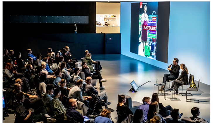
CAMP - Praha, Czech Republic